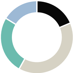
Votes against management by topic (%)***