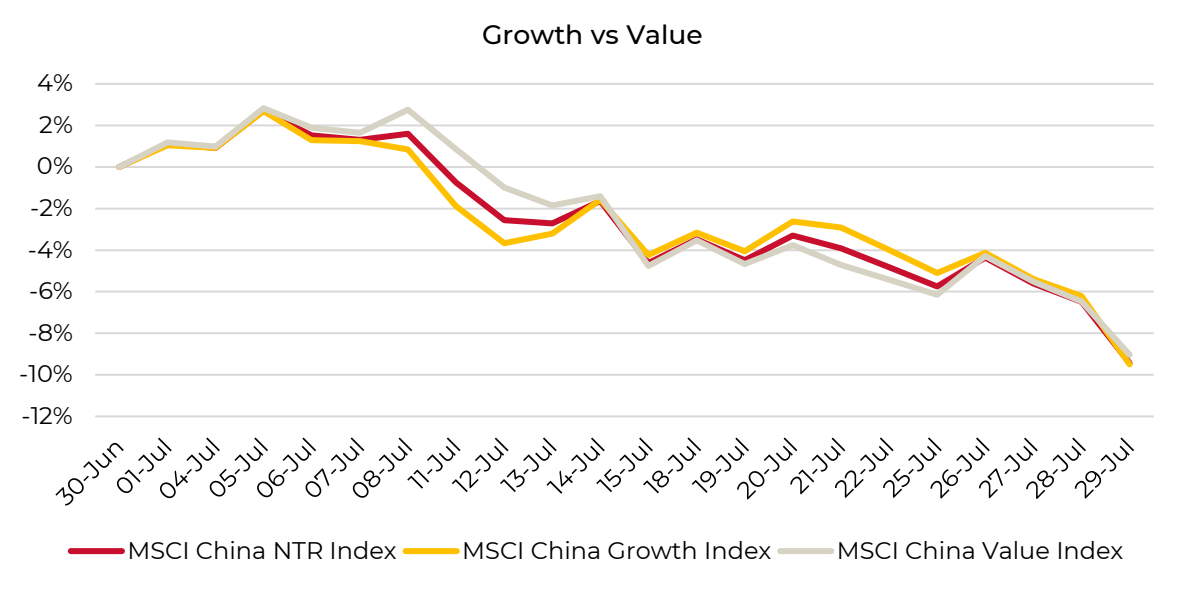
(Data from 30/06/22 to 31/07/22, returns in USD, source: Bloomberg, Guinness Global Investors calculations)

The strongest sectors were Energy, Industrials and Healthcare. The weakest were Real Estate, Consumer Discretionary and Communication Services. Due to the mortgage protests, it is no surprise Real Estate was so weak.