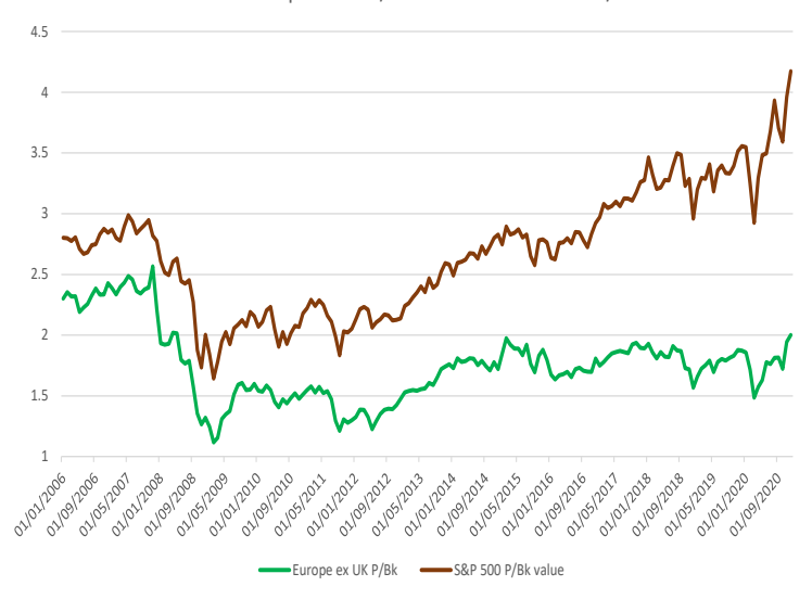
Figure 1: MSCI Europe ex UK P/Book value vs. S&P 500 P/Book, 01/01/2006-31/12/2020.

MSCI Europe ex UK P/Book value vs. S&P 500 P/Book